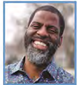
Grammy Award Winner Che "Rhymefest" Smith #rhymefestforCPS

The City Council needs to fund a plan for peace that will last! Come and be inspired by speakers, performers, and the power of community working together. Let's Take Action!