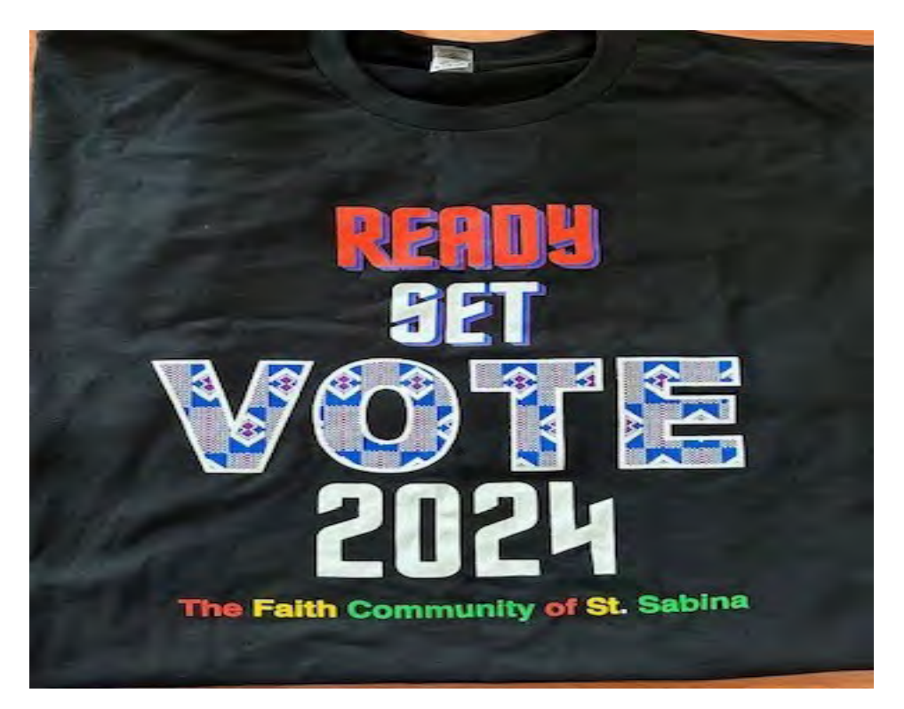
The T-shirt is for sale in the Spiritual Connection in McMahon Hall for $10 after services.

This election is too important to our democracy. If you are not registered to vote we are making it easy for you to register. Every Sunday after service, you can register in the vestibule. It is a 3-minute process. Your vote is your voice. Make your voice heard.